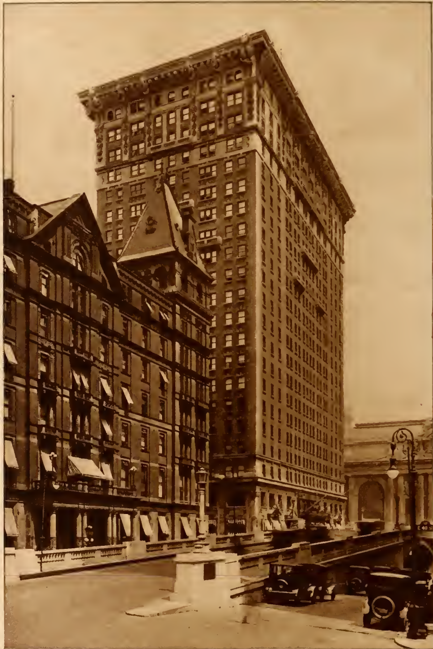
HOTEL BELMONT, facing the Grand Central Station. It has 20 stories and 50 rooms on each floor. Its lobby is one of the most spacious in a city of splendid hotels.